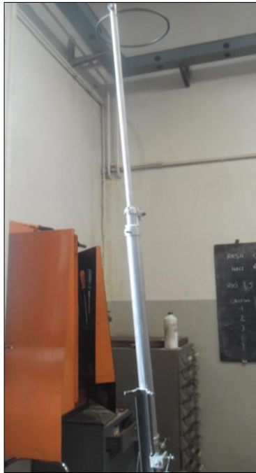
Fig. 2. 1:3 scale of harvester